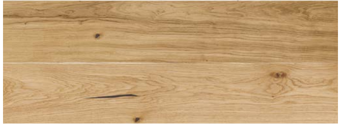
Brushed & Matt Lacquered ENG-OAK-2061