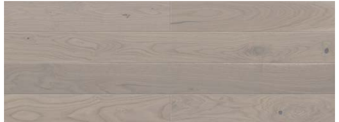
Grey Oak: Brushed & Matt Lacquered ENG-OAK-2051