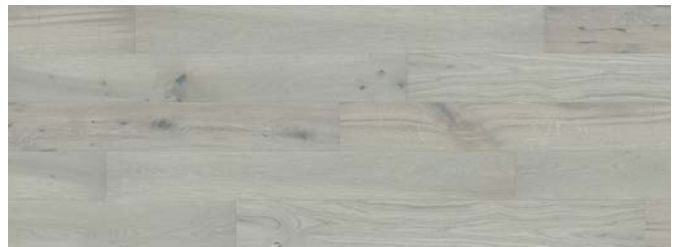
Silver Oak: Brushed & Matt Lacquered ENG-OAK-2049