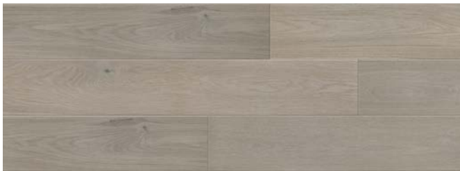
Charleston Grey: Brushed & Matt Lacquered ENG-OAK-2055