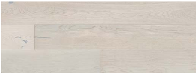
Planked White: Brushed & Matt Lacquered ENG-OAK-2057