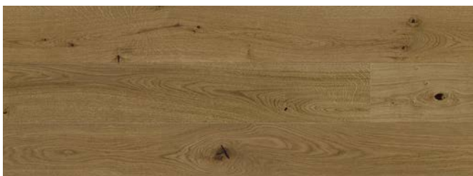
Smoked Oak: Brushed & Matt Lacquered ENG-OAK-2060