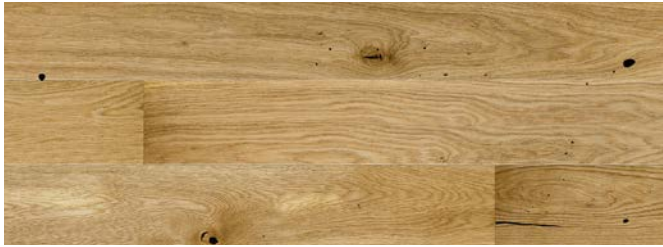
Brushed & Matt Lacquered ENG-OAK-2053