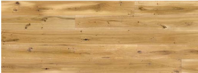
Brushed & Matt Lacquered ENG-OAK-2046