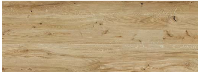
Brushed & Oiled ENG-OAK-2047