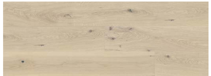
Invisible: Brushed & Matt Lacquered ENG-OAK-2058