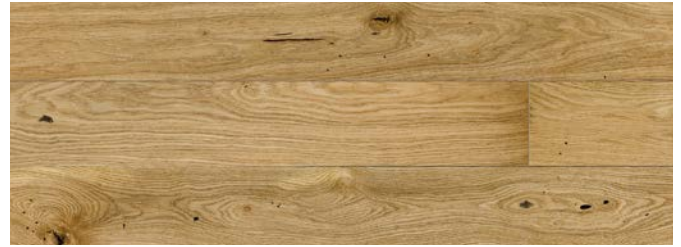
Brushed & Oiled ENG-OAK-2054