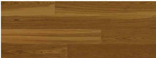
Dark Oak: Brushed & Matt Lacquered ENG-OAK-2052

Floors Shown: 1) ENG-OAK-2050 2) ENG-OAK-2052