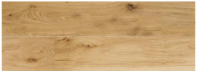
Brushed & Oiled ENG-OAK-2062