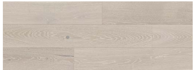
Clay Grey: Brushed & Matt Lacquered ENG-OAK-2056