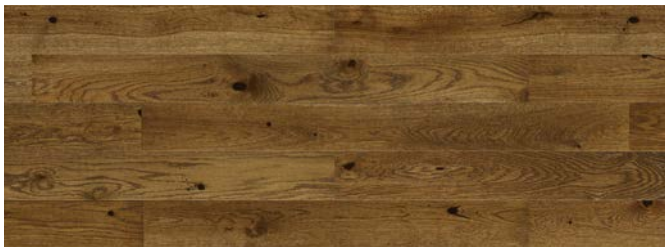
Deep Smoked Oak: Matt Lacquered ENG-OAK-2048